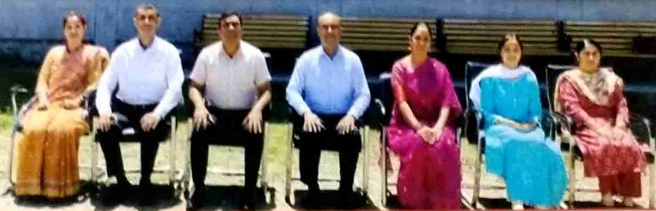
Principal with Teaching Staff