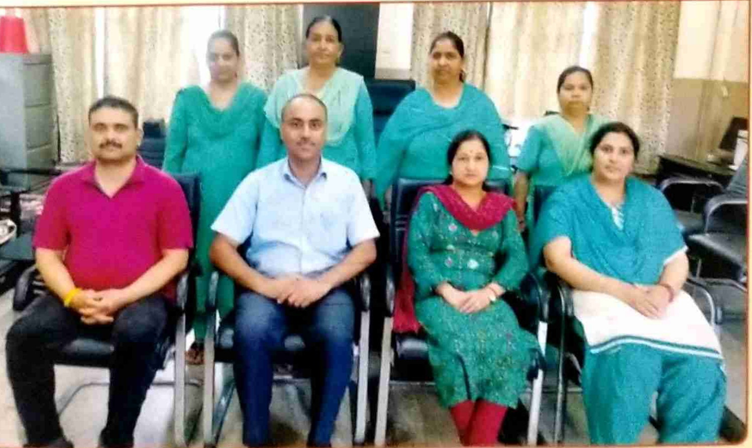
Principal with Non-Teaching Staff